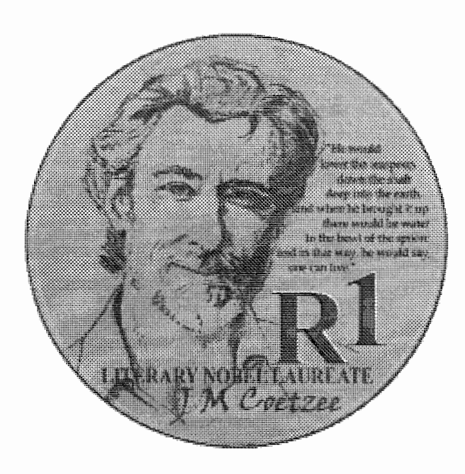
Reverse - R1 Silver Protea Coin