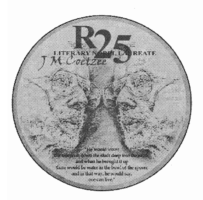
Reverse - R25 (1 oz) Gold Protea Coin