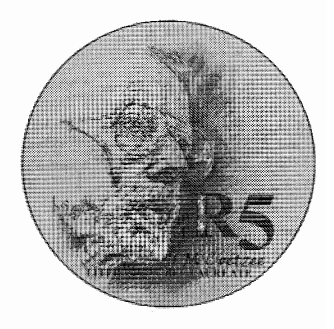
Reverse - R5 (1/10 oz) Gold Protea Coin