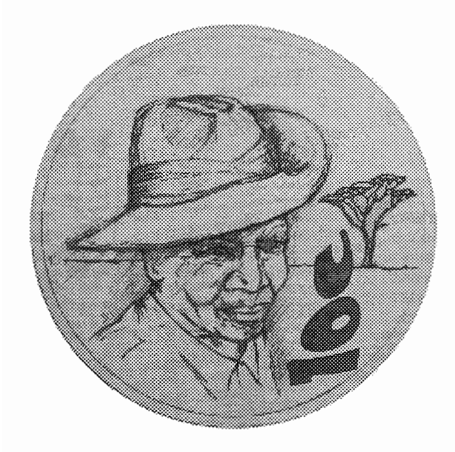
Reverse - 10c (1/2 oz) Silver Coin