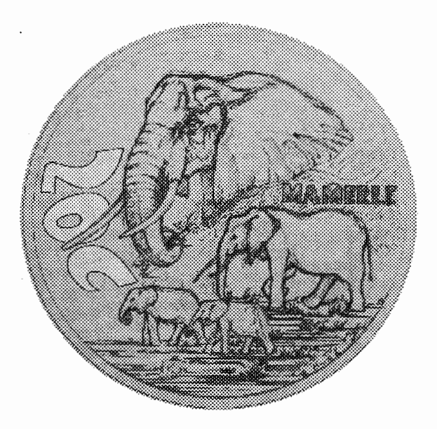
Reverse - 20c (1oz) Silver Coin