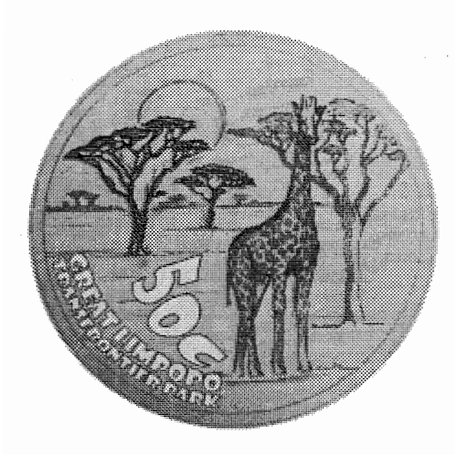
Reverse - 50c (2oz) Silver Coin